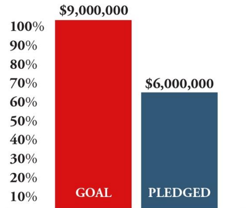
Pledged as of April 2021

Your gift will truly make a difference. Thank you for your prayers and support.