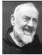
Join us 2nd Thursday of the Month for Padre Pio Prayer Meeting, 7:30 PM

If you would like a prayer card sent as an acknowledgment of your prayer intentions, please include your name and address.