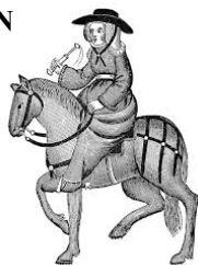
The Wife of Bath

The premier poet of the English language, Geoffrey Chaucer, introduced one of his most beloved characters, the "Wife of Bath," by this telling remark: "Husbands at church door she had five." Four times widowed, she was setting off on a pilgrimage, notably without number five. The church door is a curious detail, pointing to the fourteenth-century wedding custom of marrying on the porch of the parish church. The goal was to give maximum publicity to the consent of the groom and bride, and so consent was moved from the bride's home to a public venue. The priest would stand in the doorway and begin by sprinkling the couple with holy water. He needed to make sure they weren't too closely related and give them some instruction. He would direct the groom to pay the bride's family a dowry, and then announce the monetary amounts to the interested passersby. Only then would the guests enter the church for the wedding Mass, during which the bride and groom would hold lighted candles. The gradual move from home to church and the shift from the bride's father to the priest's authority helped to protect the freedom of brides who weren't quite as confident as the Wife of Bath.