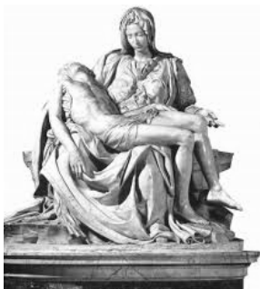
MARIA SS. ADDOLORATA - STATUE IN CHAPEL OF OUR LADY OF SORROWS